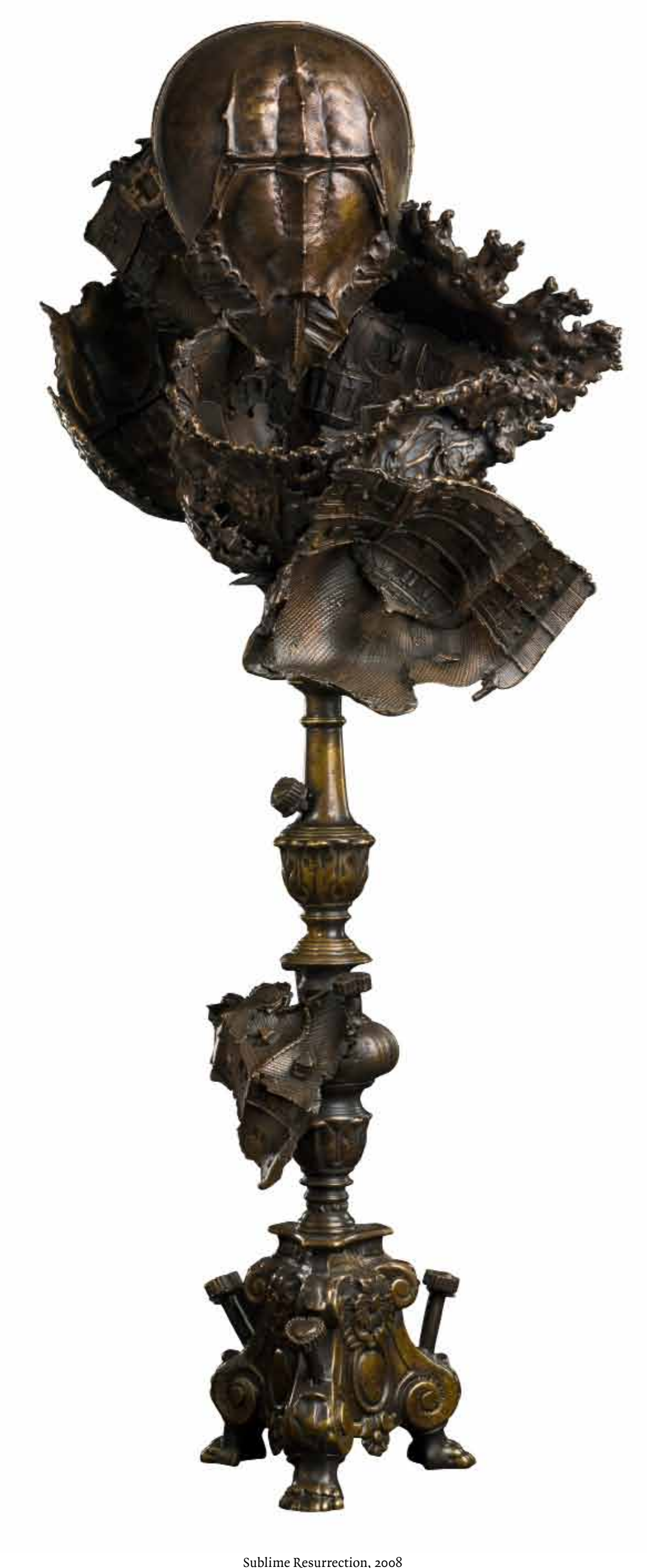
Sublime Resurrection, 2008 patinated bronze – 100 x 45 x 30 cm