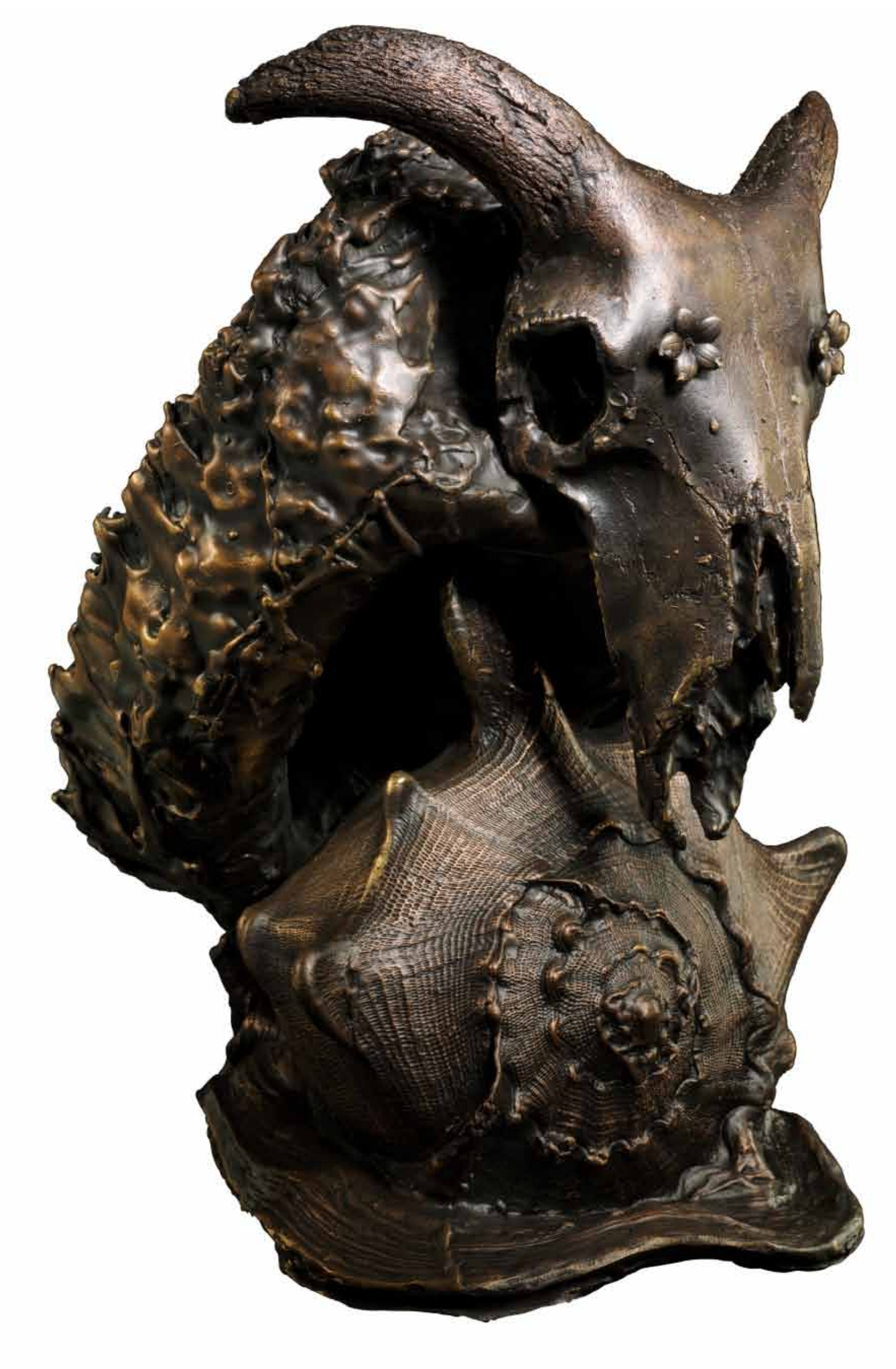
Spring Rites (back), 2007 – Private Collection patinated bronze – 27 x 26 x 38 cm